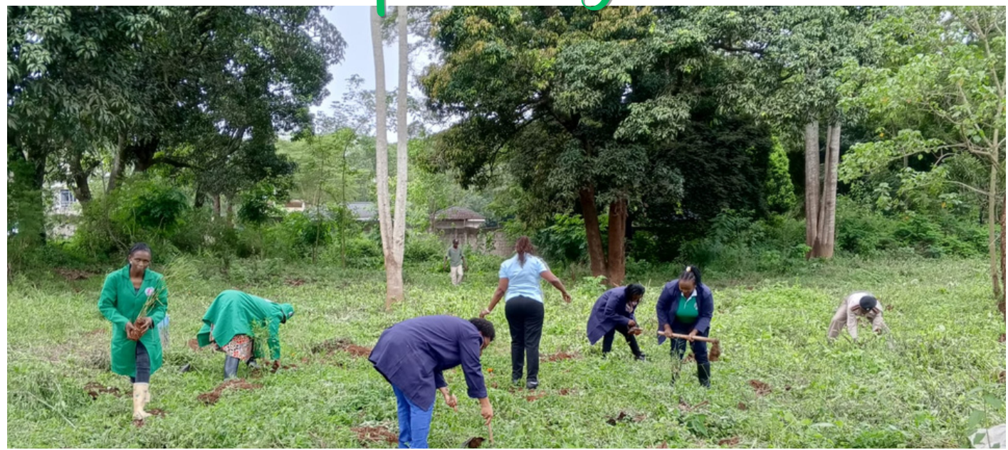
Thiwasco and other stakeholders during a tree planting session along river Chania