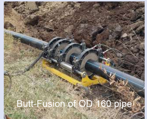
Butt-Fusion of OD 160 pipe