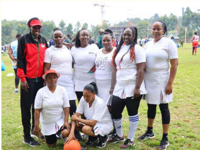
Our Fearless Netball Team