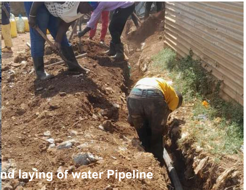
Trenching and laying of water Pipeline