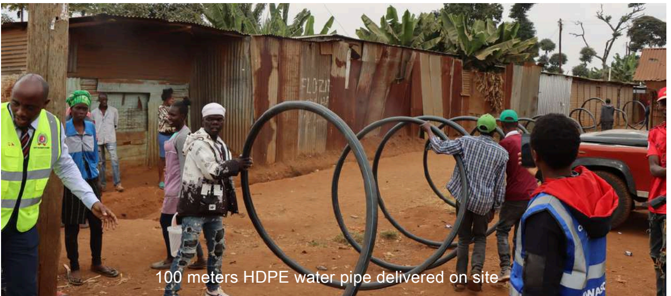
100 meters HDPE water pipe delivered on site