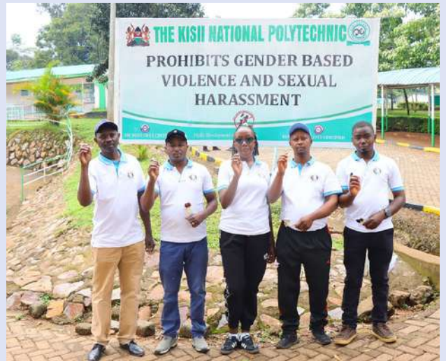
Our Precise Darts Team