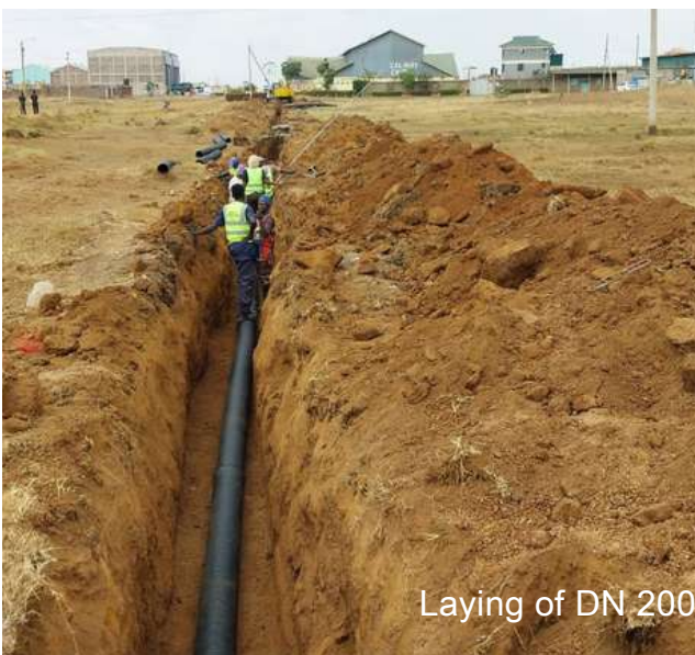
Laying of DN 200 sewer pipeline