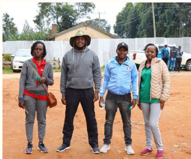
Our Brilliant Scrabble Team