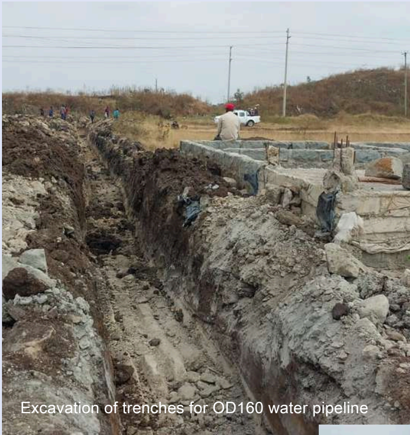
Excavation of trenches for OD160 water pipeline