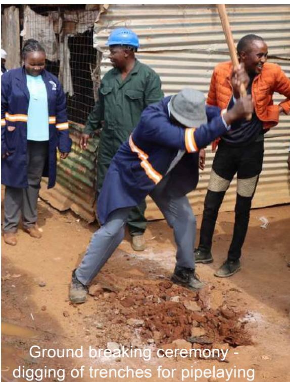
Ground breaking ceremony - digging of trenches for pipelaying

Community sensitization meetings have ensured that projects reflect local priorities, making outcomes both successful and sustainable.