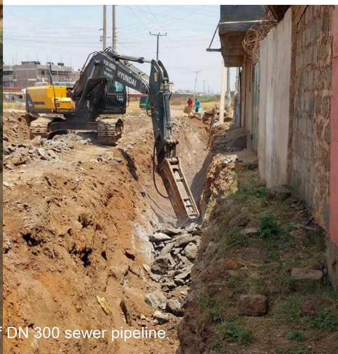
Excavation of trenches for laying of DN 300 sewer pipeline

The Kisii Sewer Pipeline Project is progressing with the excavation of trenches for the installation of a DN 300 sewer pipeline.