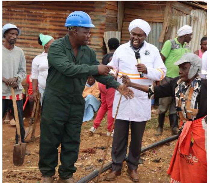
The MCA Hon.Kentams speaking to the residents during the launch of the project