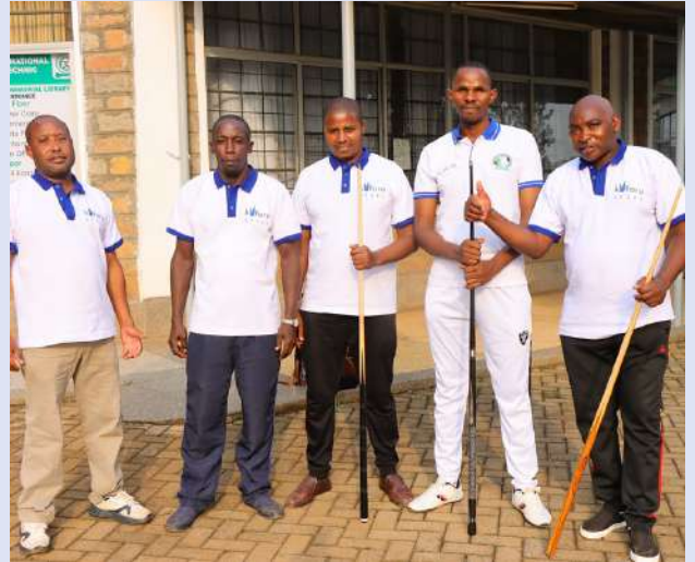
Our Dynamic Badminton Team