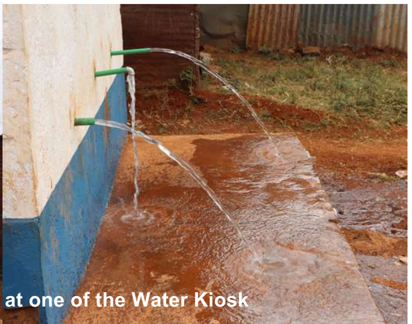
Water connectivity at one of the Water Kiosk