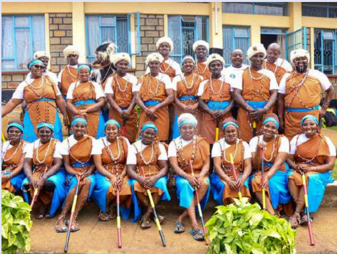
Our Vibrant Cultural Dance Team