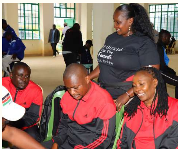
Our Skilled Ajua Team