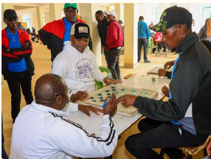
Our Sharp Draughts Team