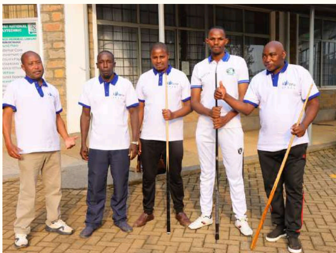
Our Bold Pool Table Team