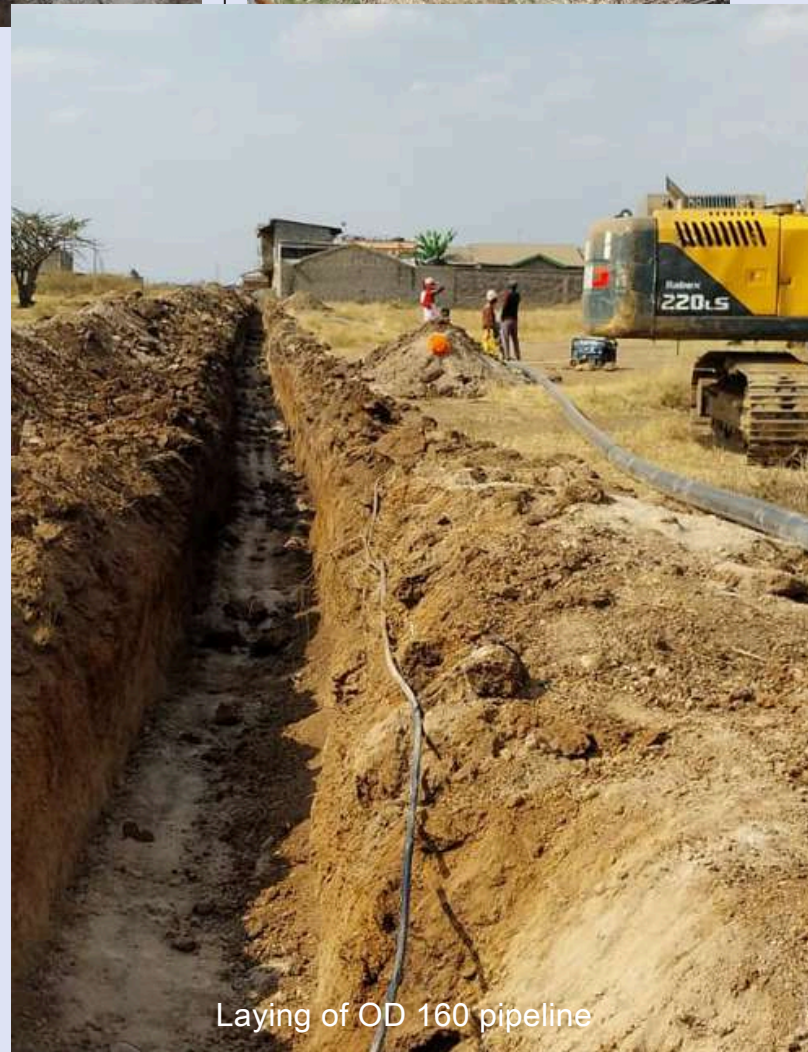
Laying of OD 160 pipeline

This extension will strengthen the distribution network, enhance service reliability, and ensure that more households have access to clean and safe water. The project underscores the commitment to expanding water infrastructure and supporting sustainable growth within our area of jurisdiction.