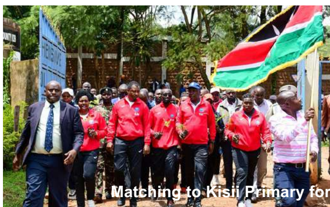
Matching to Kisii Primary for the tree planting session