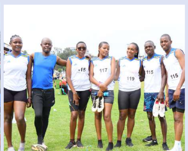
Our Swift Athletics Team