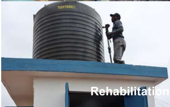
Rehabilitation of Water Kiosk