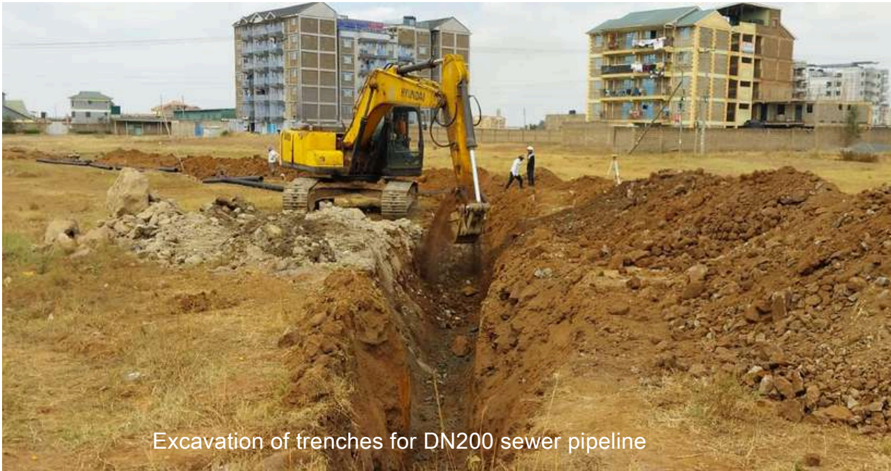
Excavation of trenches for DN200 sewer pipeline

The Castle-Kianjau Sewer Pipeline Project is on-going, focusing on the excavation of trenches for the installation of a DN 200 sewer pipeline.