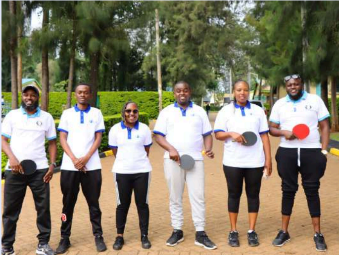
Our Relentless Table Tennis Team