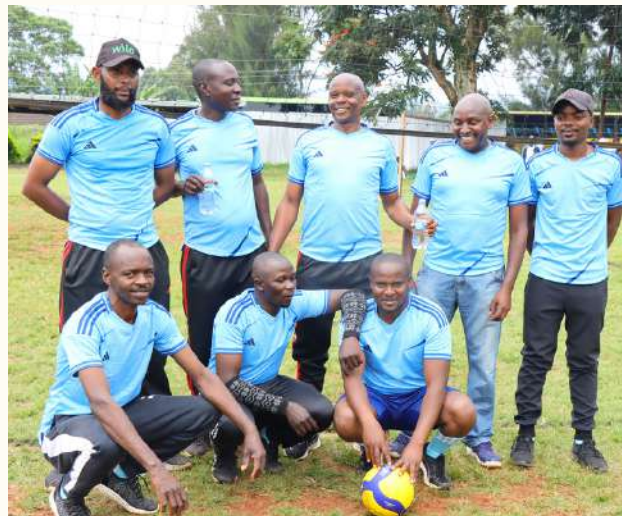
Our Flamboyant Volleyball Team